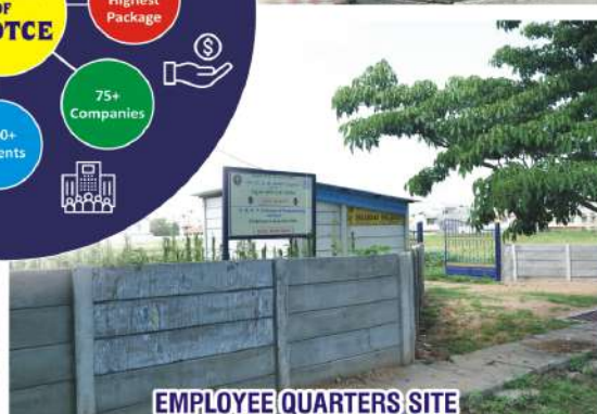
EMPLOYEE QUARTERS SITE