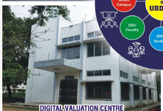
DIGITAL VALUATION CENTRE